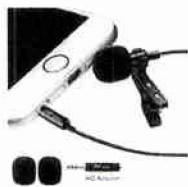
Professional #1 Best Lavalier Lapel Microphone Omnidirectional Condenser Mic for Apple... 1,220