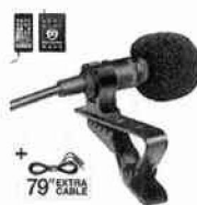
Professional Grade Lavalier Lapel Microphone Omnidirectional Mic with Easy Clip On System ... 1,932