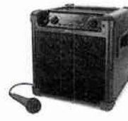
ION Audio Tailgater (iPA77) | Portable Bluetooth PA Speaker with Mic, AM/FM Radio, and... 2,391