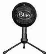
Blue Snowball iCE Condenser Microphone, Cardioid - Black 3,287 $49.00